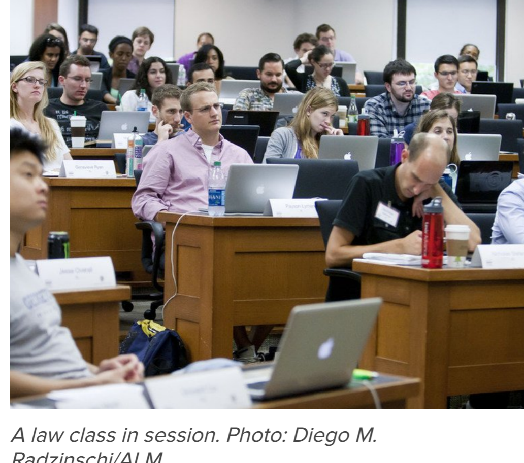
A law class in session.

More legal tech courses will be provided by law schools in upcoming semesters, especially those which focus on legal departments' software, law school professors say.