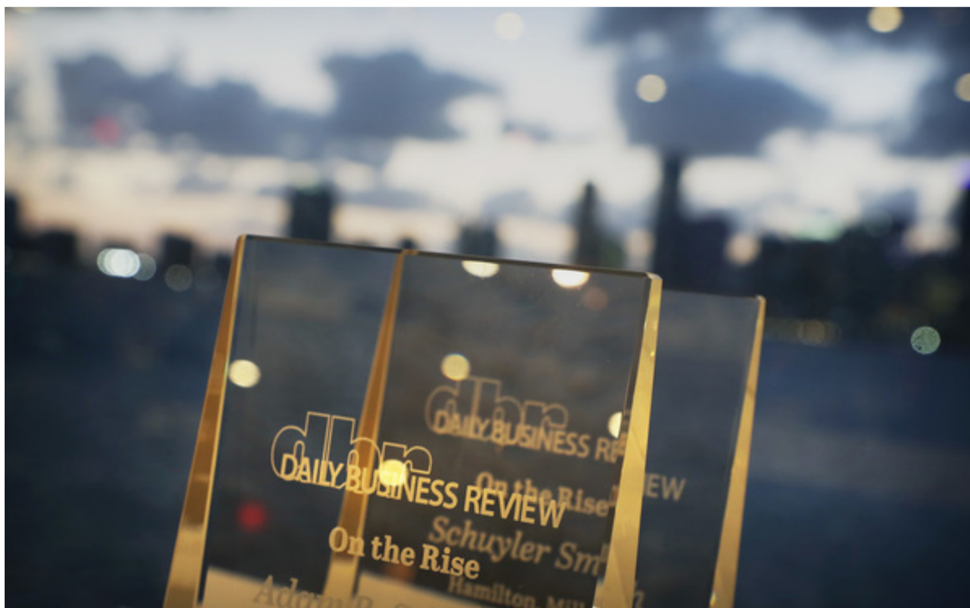
Daily Business Review's Professional Excellence Awards 2019 held at the Rusty Pelican.

Three veteran Florida litigators are finalists for the Daily Business Review's annual Attorney of the Year award for their work in vastly different areas.